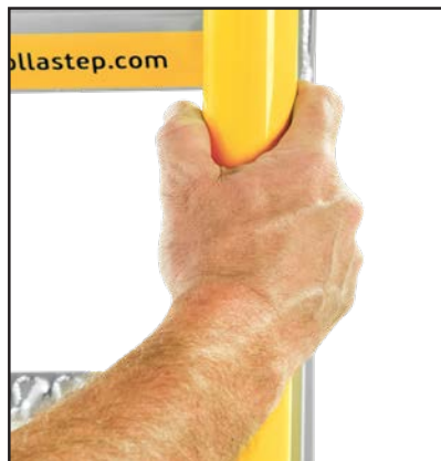
▲ Full-size, powder-coated handrails.