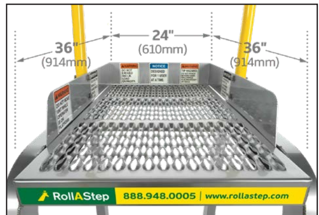
▲ Six square feet of work area is roomy enough for an operator, tools and parts.