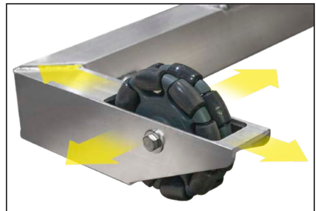
▲ The unique side-rolling casters make the TR Series easy to position in tight areas.