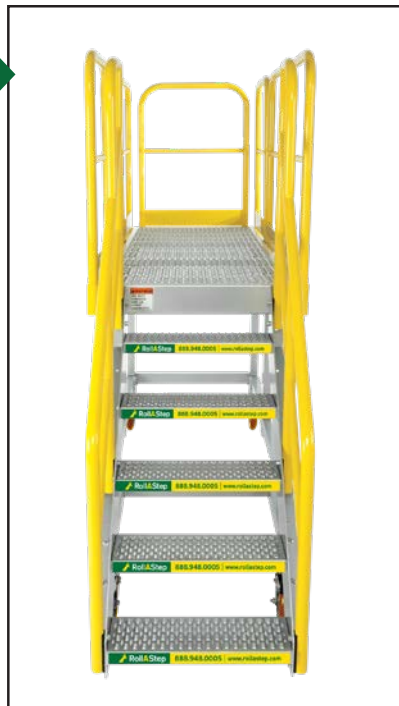
▲ Full-size, powder-coated handrails.