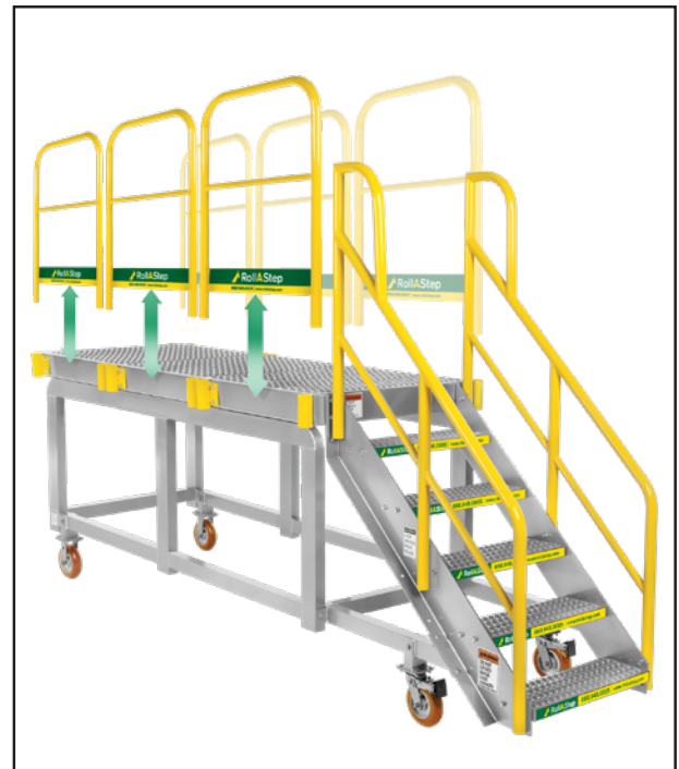
▲ Six square feet of work area is roomy enough for an operator and equipment.