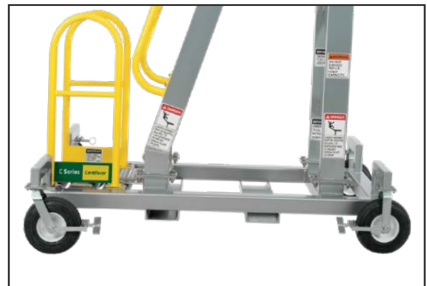
▲ Then galvanized steel base provides incredible stability, while large no-flat tires provide single-user maneuverability.