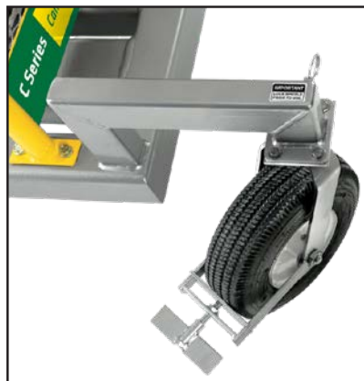
▲ Wheels swivel 360° for easy placement.