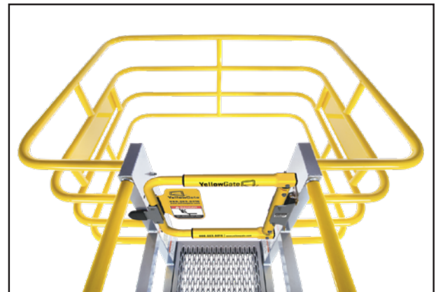
▲ The 24" wide by 48 1/8" (minimum) long platform provides ample work area. Shown with optional YellowGate swing gate.