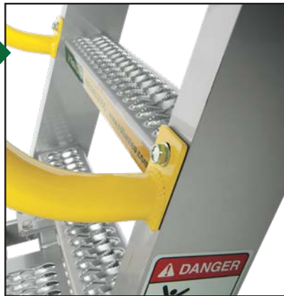
▲ All-weather slip-resistant tread.